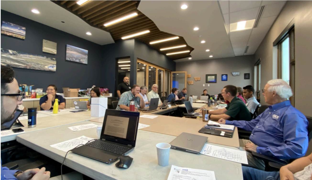
Region 8 Assembly Helena meeting in progress.

The temperament assessment process helps individuals understand different personality types, which affects how we communicate with each other and interact with our world. It is basically an updated version of the older Meyers-Briggs personality assessment process that many of us have encountered during our professional careers. The presenters were excellent, and the dialogue among attendees the training session stimulated carried over to the rest of the meeting. In addition to the Real Colors training session, Day One of the Assembly included reports from some of the Region 8 standing committees and wrapped up with a field trip to the nearby U.S. Bureau of Reclamation's Canyon Ferry Dam hydroelectric project.