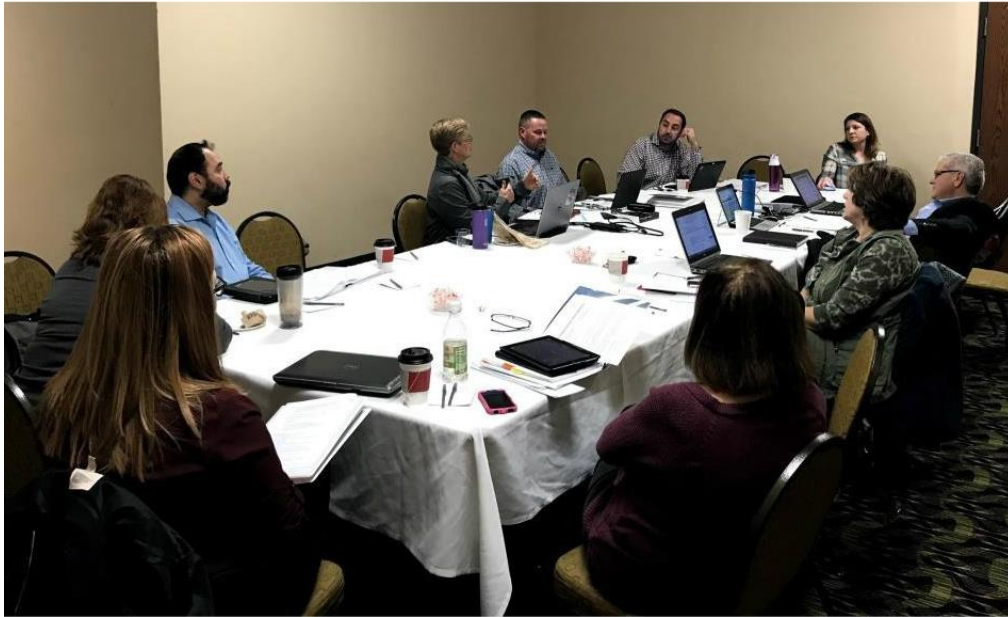
Region 7 Board Meeting at the Multi-Regional Leadership Conference