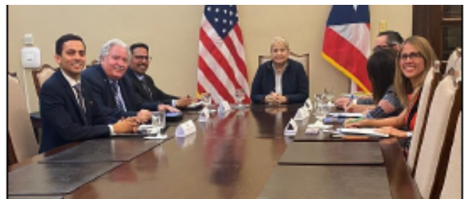
The Honorable Wanda Vazquez, Governor of Puerto Rico meets with Section Officers

On January 22, 2019, the Section met with Puerto Rican Governor Wanda Vazquez to discuss the results of the infrastructure report card.