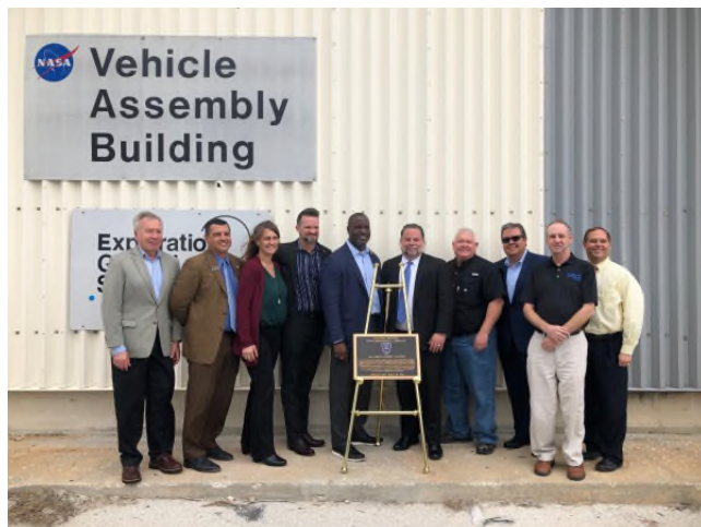
Representatives from ASCE and NASA during the January 10, 2020 Ceremony

Built in 1966 at NASA's Kennedy Space Center in Merritt Island, Florida, the Vehicle Assembly Building (VAB), is a national landmark that remains a central element of NASA's plans to launch people and equipment deep into space on missions of exploration. The VAB is 525 feet tall, 716 feet long and 518 feet wide. It covers 8 acres and encloses 129,428,000 cubic feet of space. When constructed it was the largest building in world by volume and remains the tallest building in the US outside an urban area. The VAB housed the Saturn launch vehicles and the Space Shuttle. Efforts were led by ASCE Florida Section History and Heritage Chair Kathi Ruvarac.