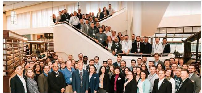
Attendees of the 2020 MRLC in Philadelphia, PA