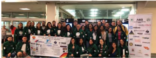
ASCE-UPRM team in Orlando, Florida at the 2020 ASCE Southeast Regional Student Conference