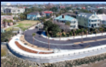
Low Battery Project

Section Educator of the Year - Educator within South Carolina Section Boundaries that has demonstrated excellence at developing the next generation of Civil Engineering students