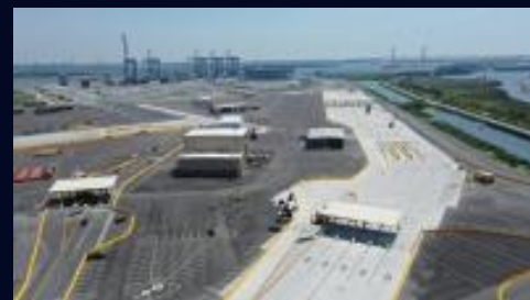
Hugh K. Leatherman Terminal Phase 1 Construction Project

Technical Merit Award - Recognition for outstanding project or technical innovation