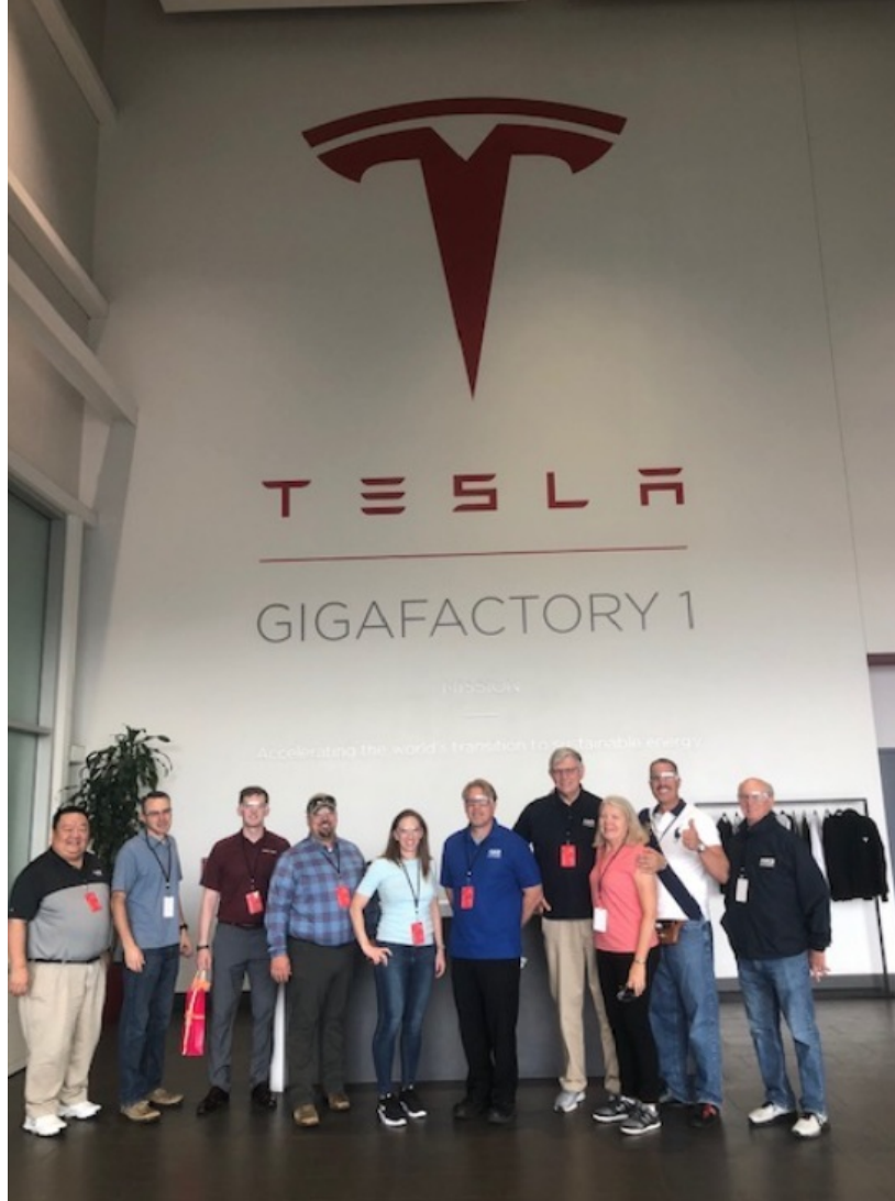
Region 8 Board of Governors at the Tesla Gigafactory

On Friday and Saturday September 6 and 7, 2019, the Fall Planning Meeting of the Region 8 Assembly, consisting of delegates from each of the twelve Sections in Region 8, plus the Region 8 Board of Governors was held (also at the Silver Legacy Resort and Casino). The delegates worked through a packed agenda, which included time off on Friday afternoon for delegates to go on a separate tour of the Tesla Gigafactory. At lunch on Saturday, the Region 8 awards were handed out: