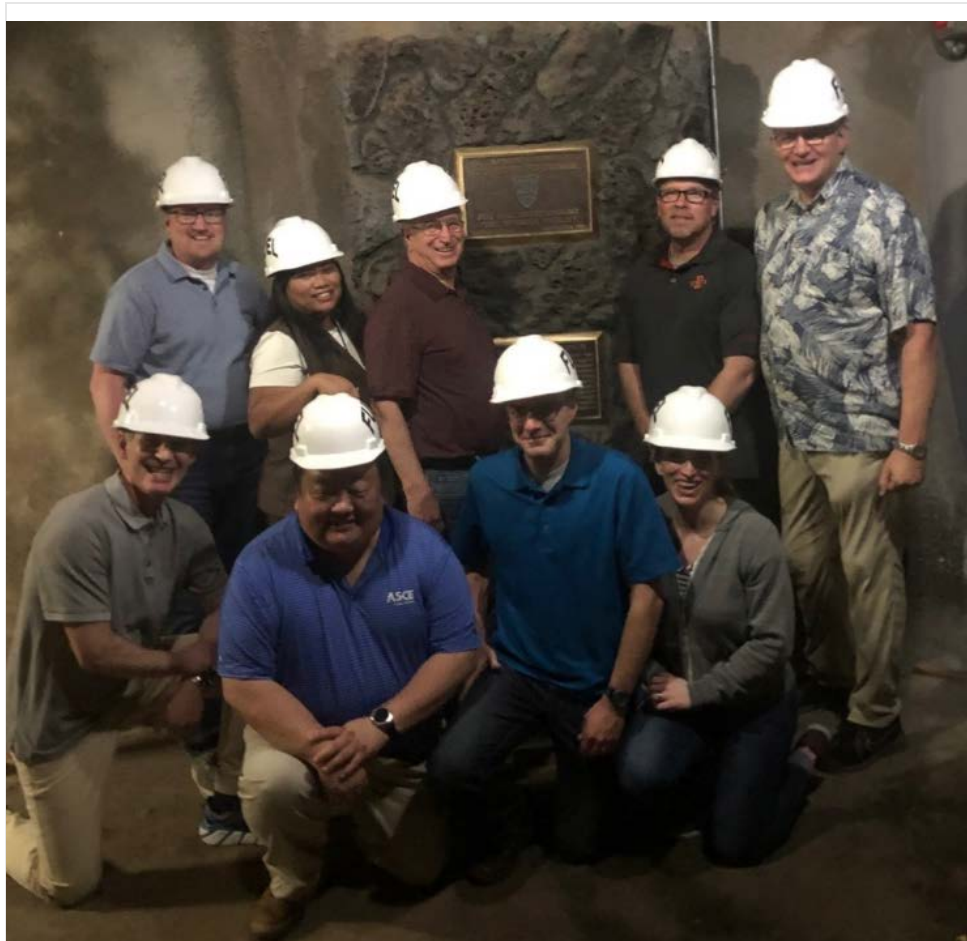
The Region 8 BOG touring the Red Hill Fuel Storage Facility