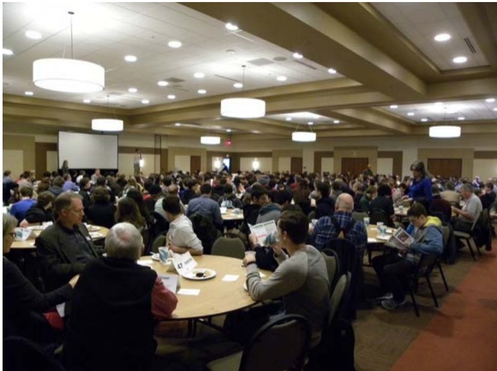
Mid-Willamette Valley Future Engineers Luncheon