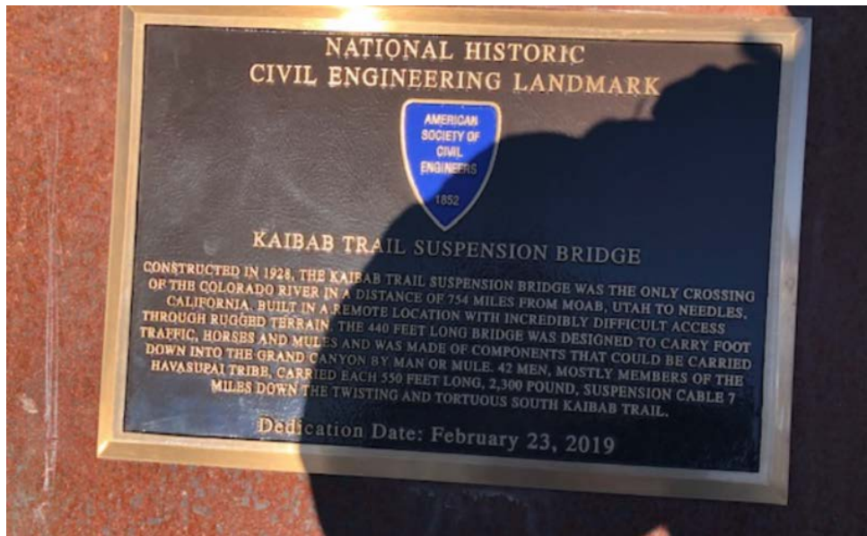
The Kaibab Trail Suspension Bridge NHCEL Plaque