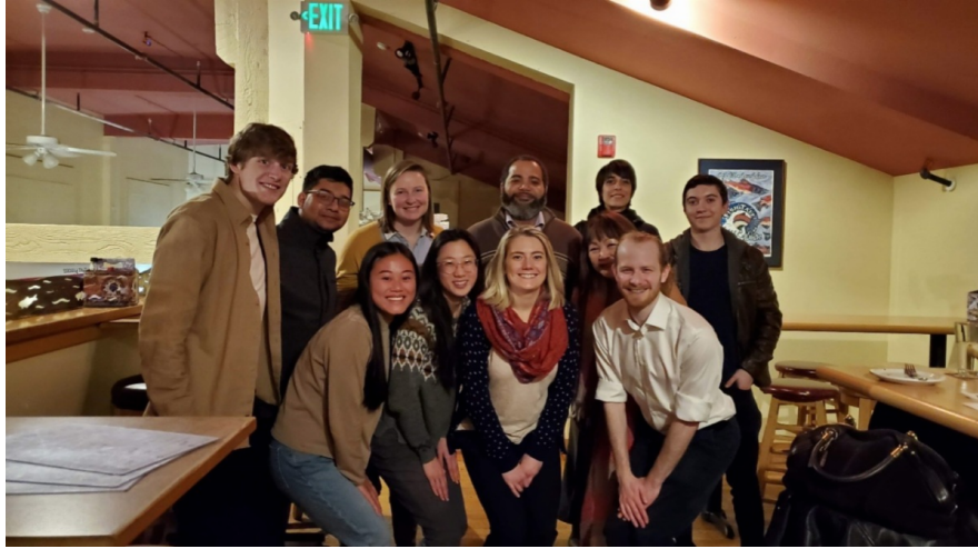
2/10/20 Social at Fish Tale Brewhouse in Olympia

Later in the month of February, the Tacoma-Olympia and Seattle members met at the Seattle Museum of Flight for a Popsicle Bridge Competition: