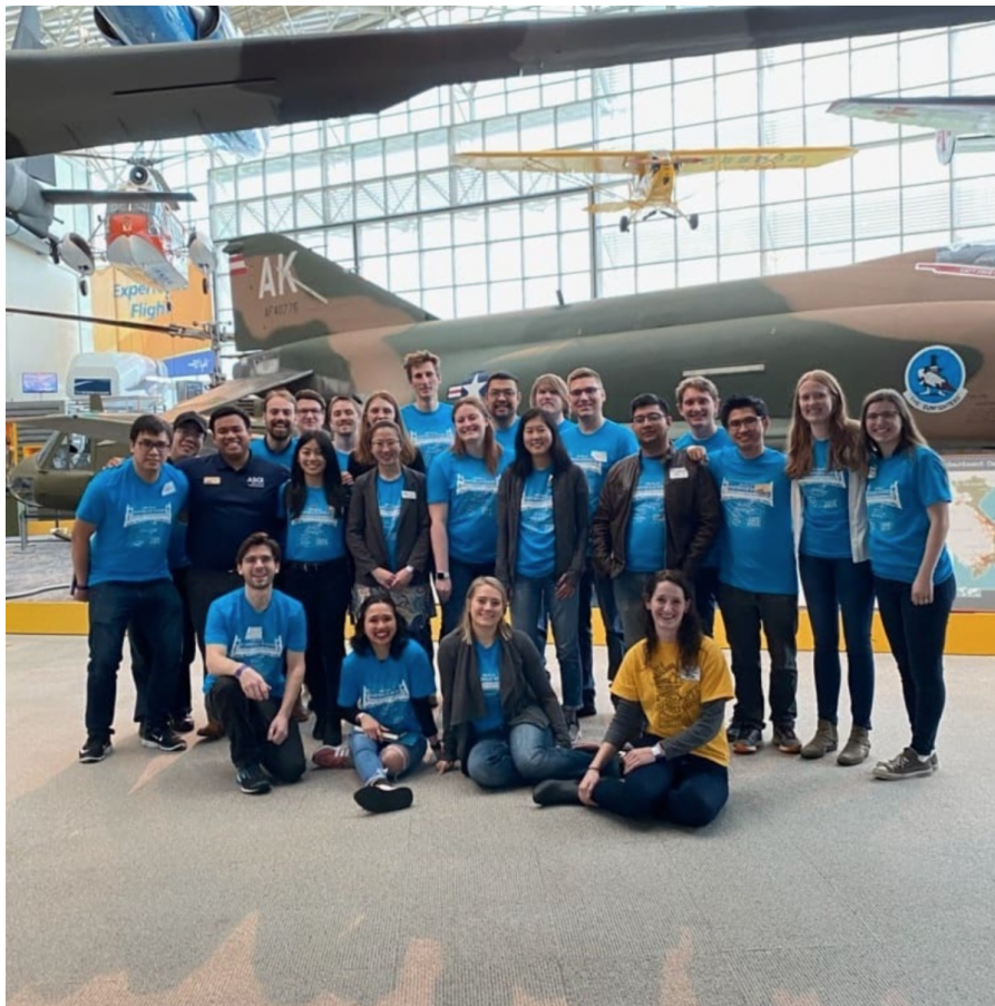
Popsicle Bridge Contestants at Seattle Museum of Flight

Later in the month of February, the Tacoma-Olympia and Seattle members met at the Seattle Museum of Flight for a Popsicle Bridge Competition: