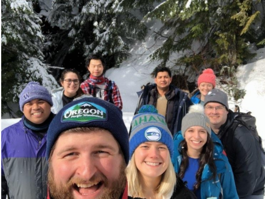
Ski Trip weekend at Snoqualmie