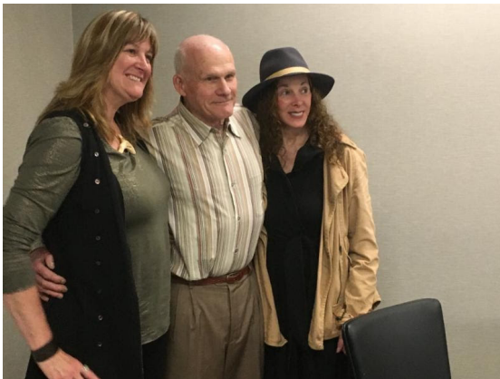
A photo from the Section's annual Honors and Awards Section Meeting