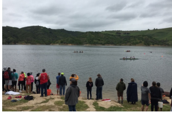
Concrete Canoe Event

At the conference I spent my time helping as a judge for the surveying competition. Teams were challenged to run a traverse around a predetermined course and were judged on their calculation correctness and completeness of field notes. The top winner in the surveying competition was UC Irvine with CSU Fullerton and Long Beach State rounding out the top 3. Fun competition on a day that turned out to be not that hot!