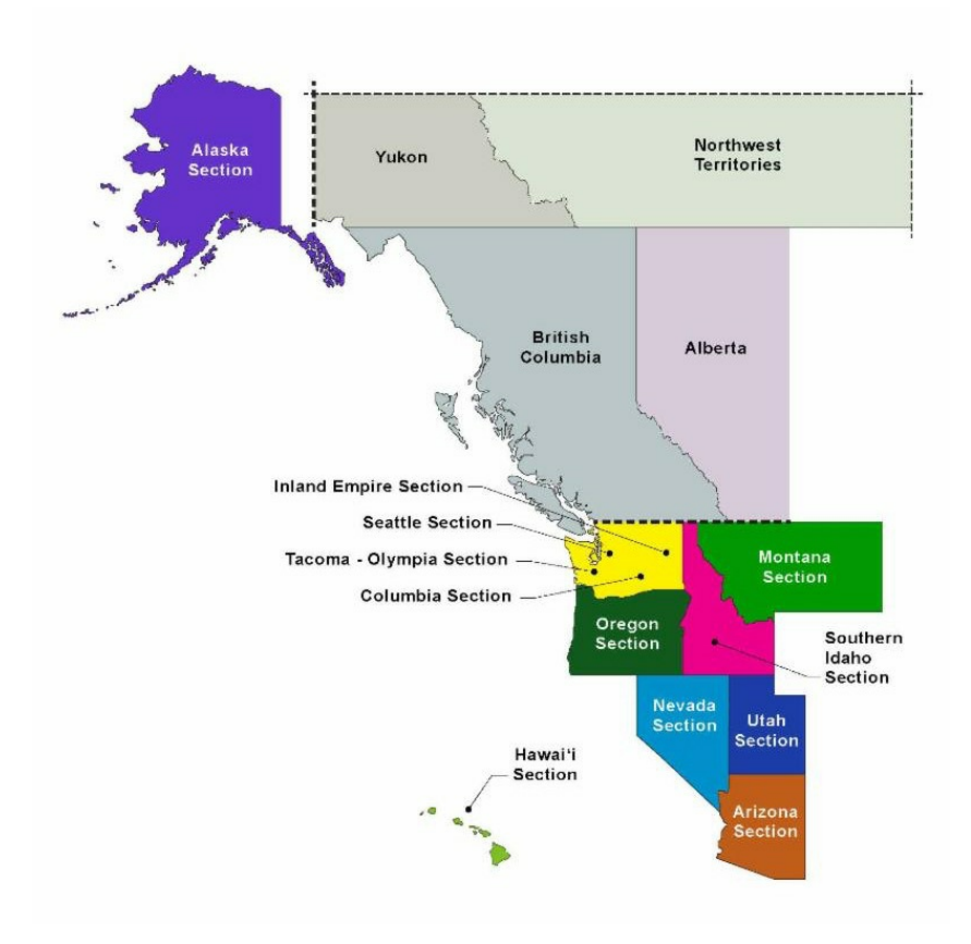
"advance the Civil Engineering profession by serving the members of Region 8 as an extension of Board of Direction"