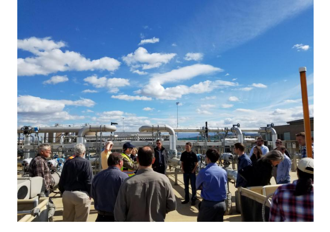
Spokane County Regional Water Reclamation Facility Tour