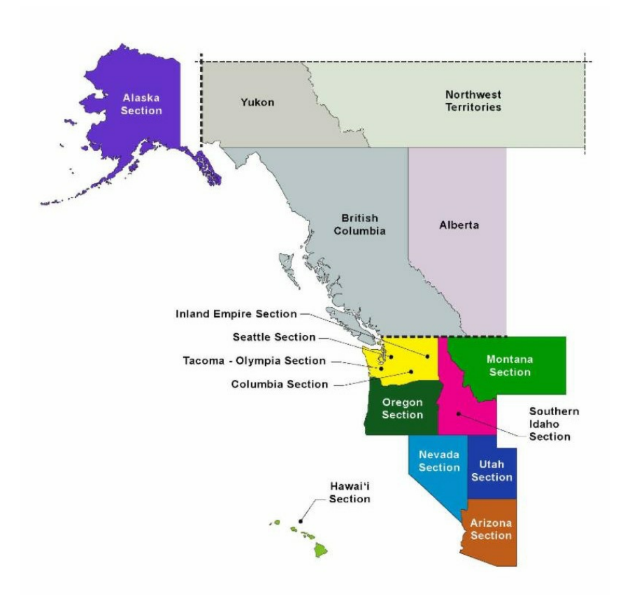
"advance the Civil Engineering profession by serving the members of Region 8 as an extension of Board of Direction"