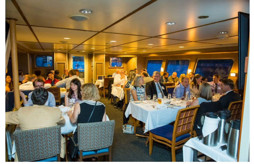
ASCE Oregon members celebrate at the Annual Gala on the Crystal Dolphin