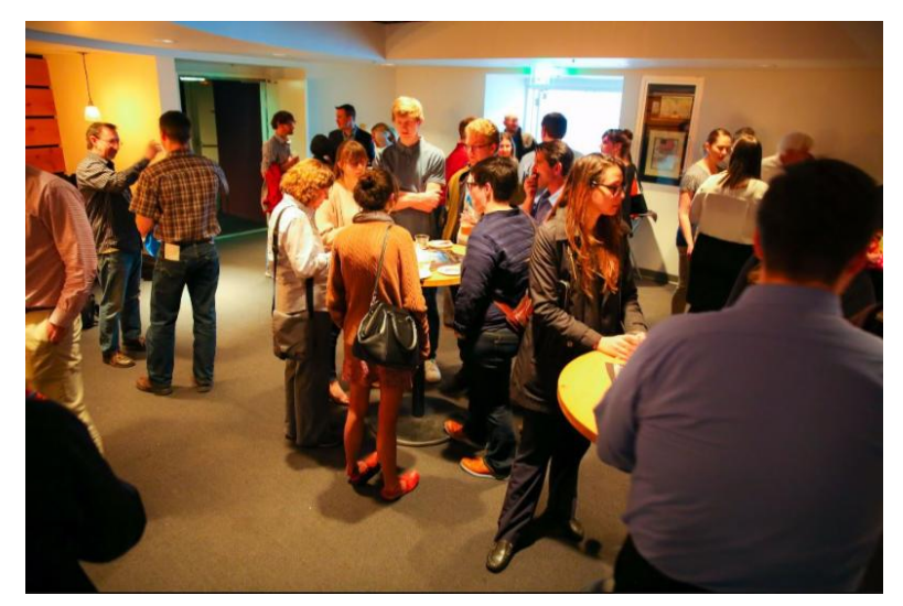
"Reel Science" event at OMSI brings out young professionals and others interested in Engineering

The government relations team got down to business this year and also got a taste of victory. The Oregon Legislature is functionally biennial with a long session one year for new legislation and a short session the following year geared more for legislative housekeeping; this was the long session with a lot of important bills in STEM, Seismic Resiliency and Transportation Funding on the table. We pored through draft legislation and weighed our positions. At the 'Day at the Capital' we met with our representatives. The crown jewel was a $8.2B transportation funding package. We attended a number of hearings and collaborated with our partners to track and support this legislation. In July we were proud to see a slightly reduced $5.3B transportation package signed by our Governor. We learned a lot this year and are encouraged to be more active in future years; especially pushing STEM and Seismic Resiliency-issues that really need attention from our state leadership.