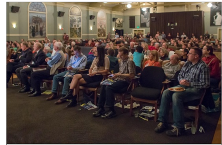
Over 300 attend Unprepared showing in Portland.

We have had a great year of promoting seismic resilience for Oregon as we continue our efforts to raise awareness about the risks we face from a magnitude 9.0 Cascadia Subduction Zone earthquake. With support from a SPAG grant and a Region 8 Special Grant we have held two very successful showings of the Unprepared documentary at theatre pubs, followed by Q&A with an expert panel and emergency preparedness raffle prizes. The documentary was created by OPB and the Oregon Field Guide, with support from ASCE Oregon, and contrasts the aftermath of the 2011 Tohoku earthquake in well prepared Japan with what may happen in unprepared Oregon. Showings have been had in Portland and Salem so far; two more are planned for Bend and Ashland.