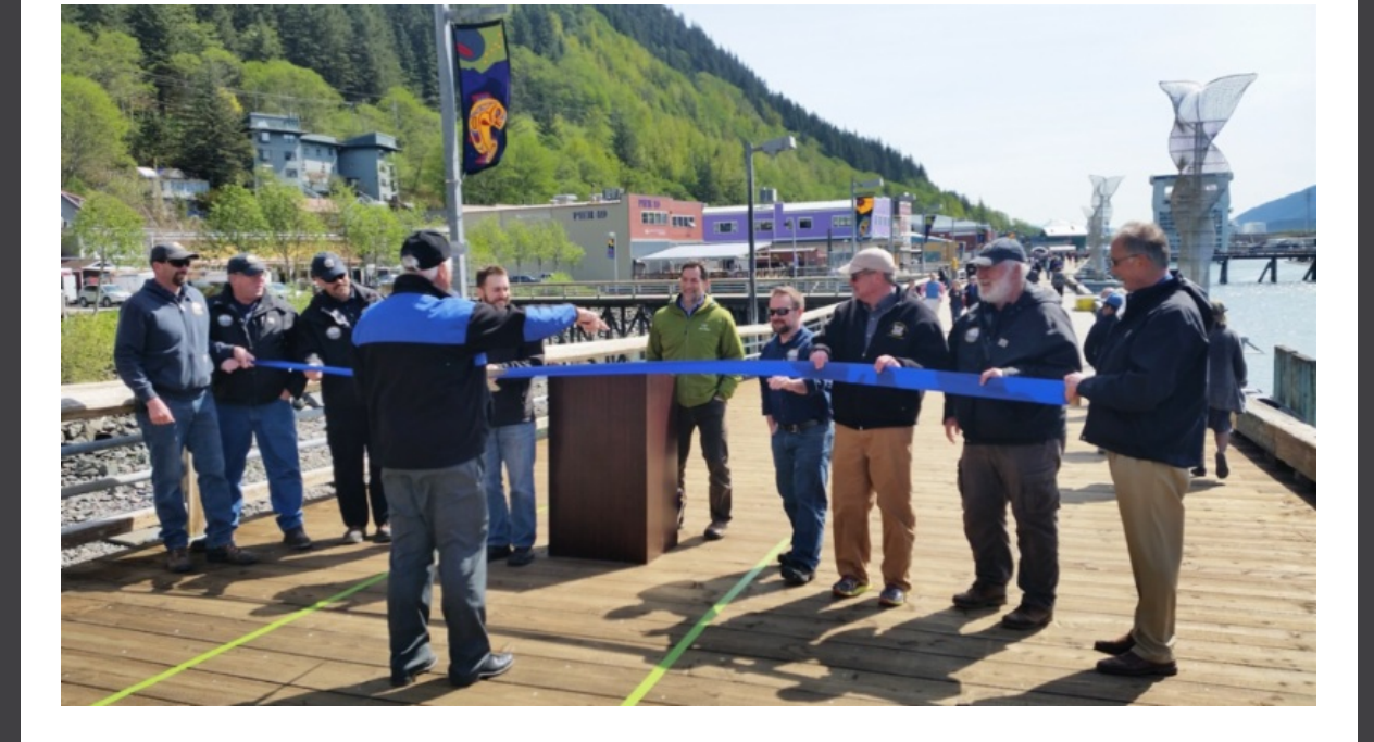
Juneau Alaska, Port Facilities, Infrastructure Week Awareness

Have you hired a student engineer as an intern for the summer? It is good way to consider future employees, help build their skills, and for them to make some money.