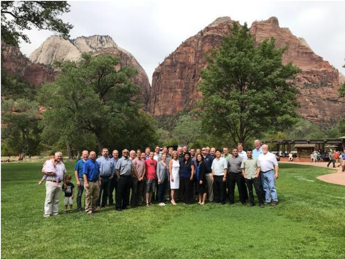
2017 Region 8 Assembly, Zion National Park, Utah

The BOG met the first day and did our second face-to-face meeting for the year, which accomplished board items that we normally do on our monthly conference calls, and then focused on the agenda for the next two days with the Assembly. The Assembly was comprised of one or two leaders from each of the twelve sections of the Region. The attending representatives showed that they were excited to be involved and share their Section's accomplishments and actives with everybody. It was exciting to be part of the Assembly activities, and the members of each of these Sections have elected some very good leaders.