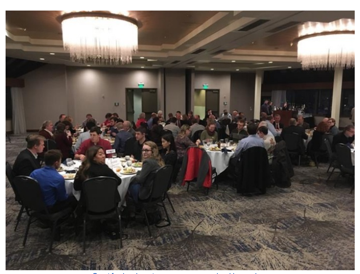
Great food and great company, a very enjoyable evening.