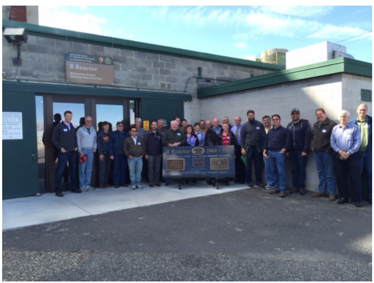
Inland Empire Section at the B Reactor, Hanford WA

The B Reactor was listed in the National Register of Historic Places in 1992, was designated a National Historic Civil Engineering Landmark in 1994, and became a National Historic Landmark in 2008. B Reactor has been open for annual public tours since 2009, and gets more than 10,000 visitors each year. The facility has been toured by guests from all 50 states and more than 80 countries worldwide.