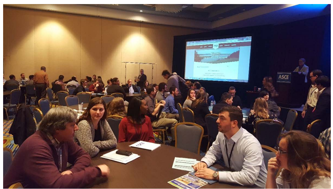
Region 7 Breakout Session at MRLC