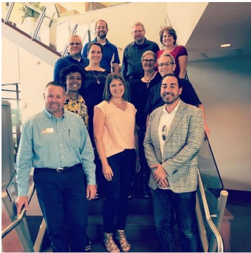
At left: Region 7 Board of Governors at Annual Meeting

On Saturday, presentations on the role of Region 7 and resources available through Society's Geographic Services Team were given. Assembly delegates shared the highlights of their Section/Branch with the Board and delegates as well. This was followed by a roundtable discussion of successes and struggles throughout the Region. The goal was to provide a venue for Society Leaders and the Section and Branches to discuss issues of concern and to develop action items for improving ASCE at the local level.