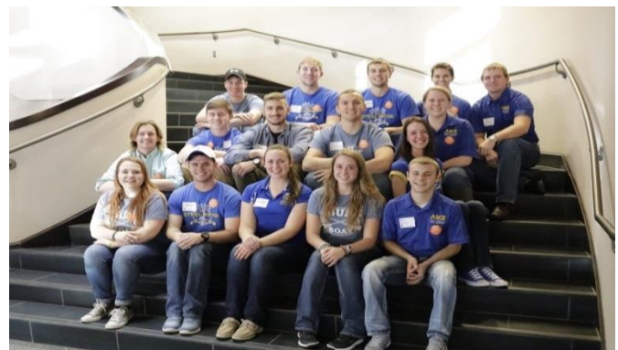
ASCE professional and student members attending the DREAM BIG Viewing Party