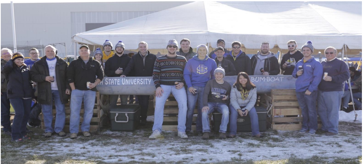
Governor Erin Steever with SDSU students and SD ASCE members at the Beers with Engineering SDSU tailgate.