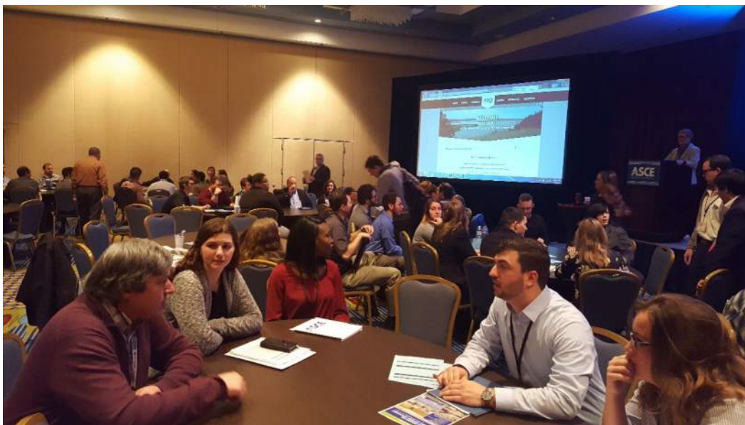
Region 7 Breakout Session at MRLC