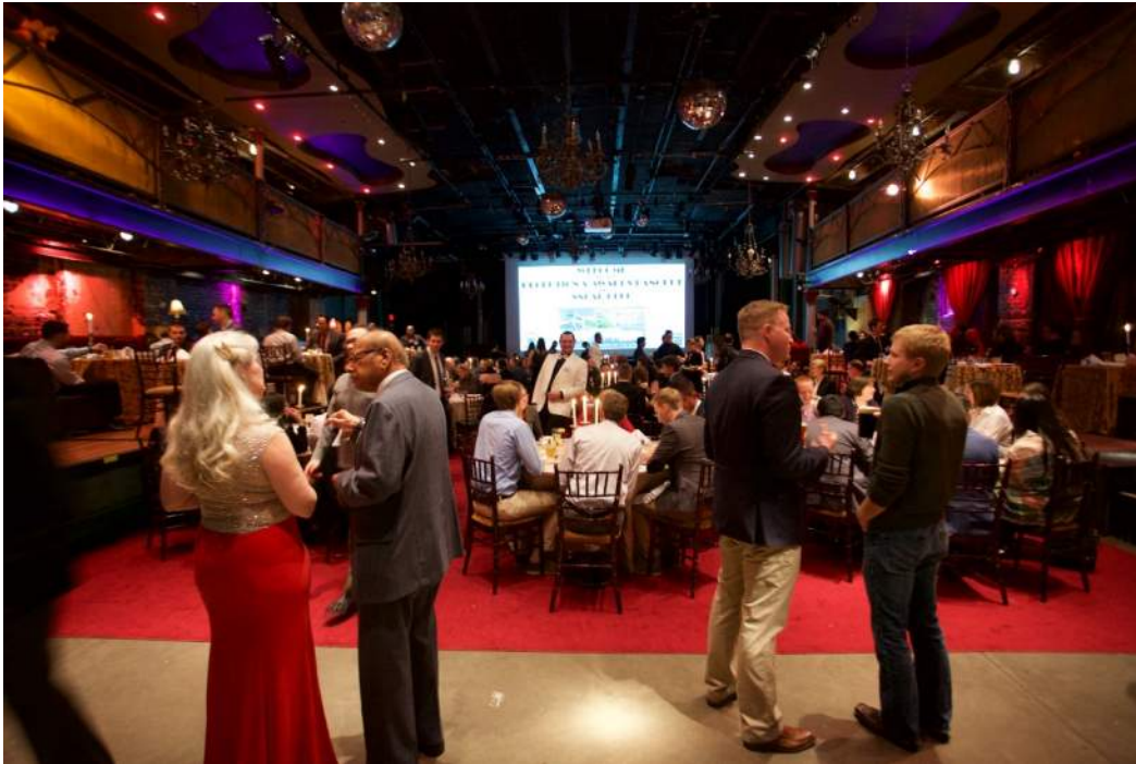
Dream Big Sneak Peak Gala at the Varsity Theater

Governors also had the opportunity to meet with the two candidates who will be on this spring's Society ballot for President-Elect. All Region 7 attendees met together on Friday, February 3, and learned more about the Region's role in acting as a conduit between Sections/Branches, Younger Members, Students, and the Society, and had a chance to discuss successes and challenges among those in the same geographic state. Friday night, there was an opportunity to view a sneak peak of the Dream Big movie at a red-carpet gala at the Varsity Theater, and the Younger Members learned how to go Curling Saturday evening.